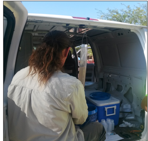
Sampling at Formerly Used Defense Site

The Environmental and Munitions Center of Expertise (EM-CX), part of the U.S. Army Engineering and Support Center, Huntsville, has applied a number of these LTMO methods to DOD and Superfund sites. The EM CX and EPA jointly developed the Roadmap to LTMO guidance ( www.clu-in.org/download/char/542-r-05-003.pdf ), and the EM CX staff has instructed in courses on LTMO for the EPA.